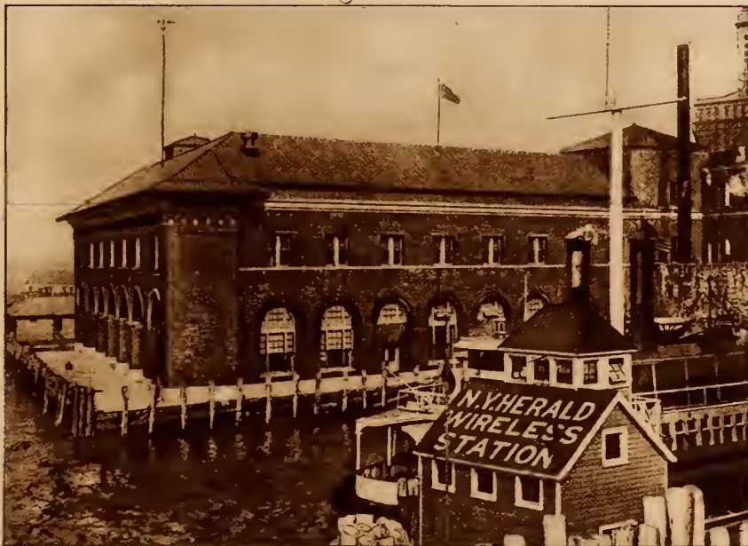
U. S. BARGE OFFICE. Official home of Immigration Department, supervising new arrivals.